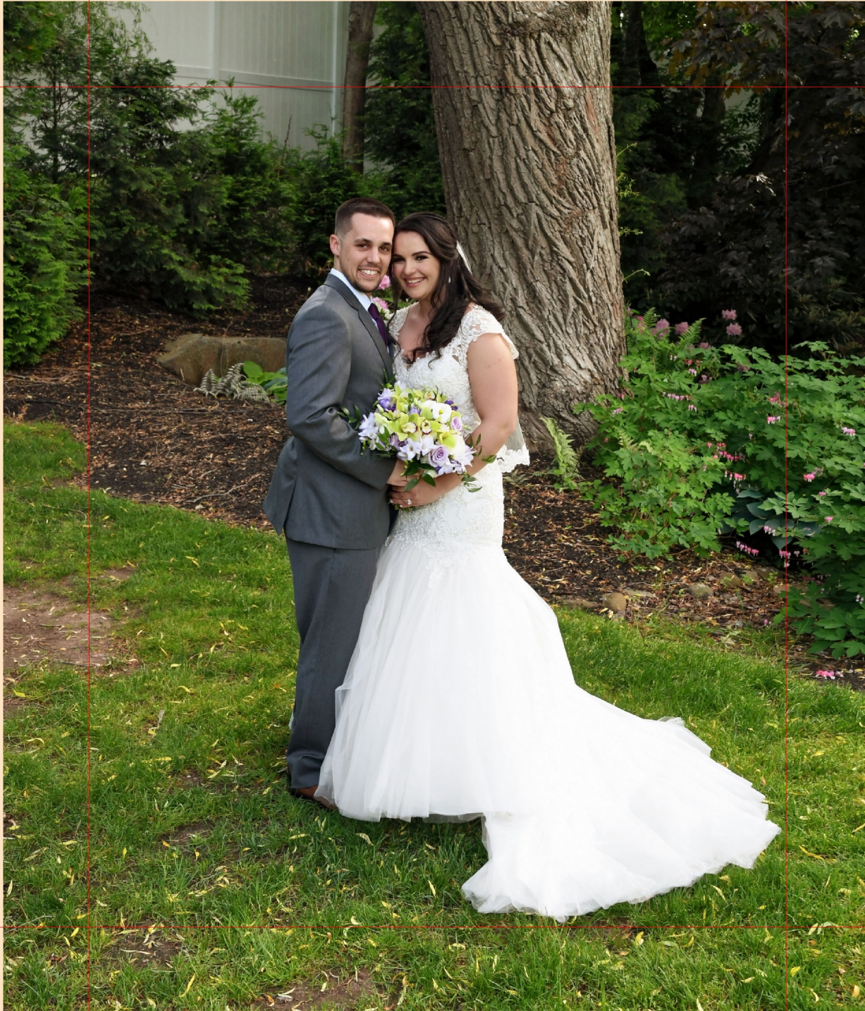
Wedding Album 10x10 (COMO-1-CONT)

It is necessary that the area outside the red lines, that is the abundance of the picture for the preparation of the cover, does not remain white. Must be covered entirely by the image selected, avoiding that it contains important details, because they will not appear on the front cover.