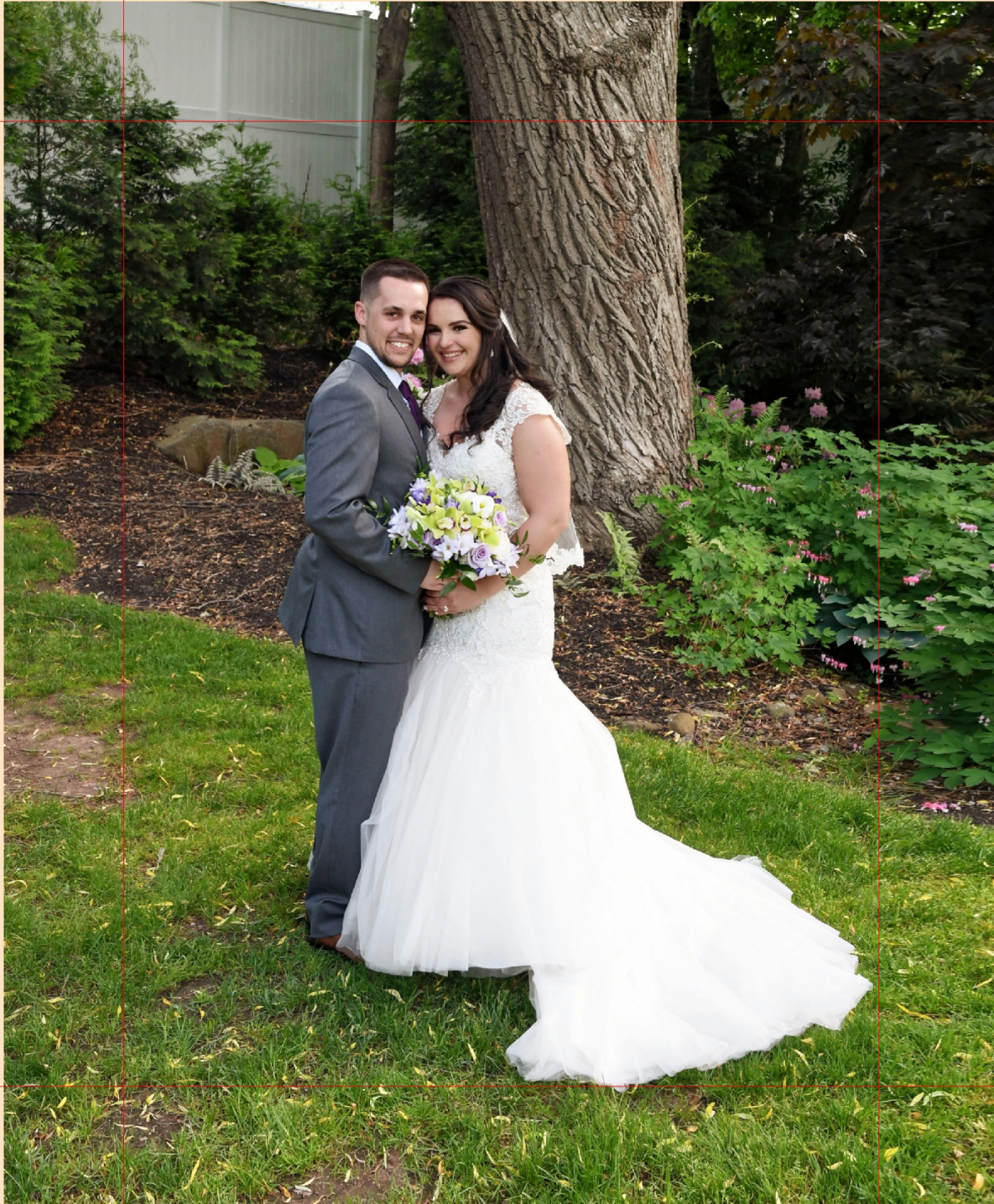
Family Flex 8x8

It is necessary that the area outside the red lines, that is the abundance of the picture for the preparation of the cover, does not remain white. Must be covered entirely by the image selected, avoiding that it contains important details, because they will not appear on the front cover.