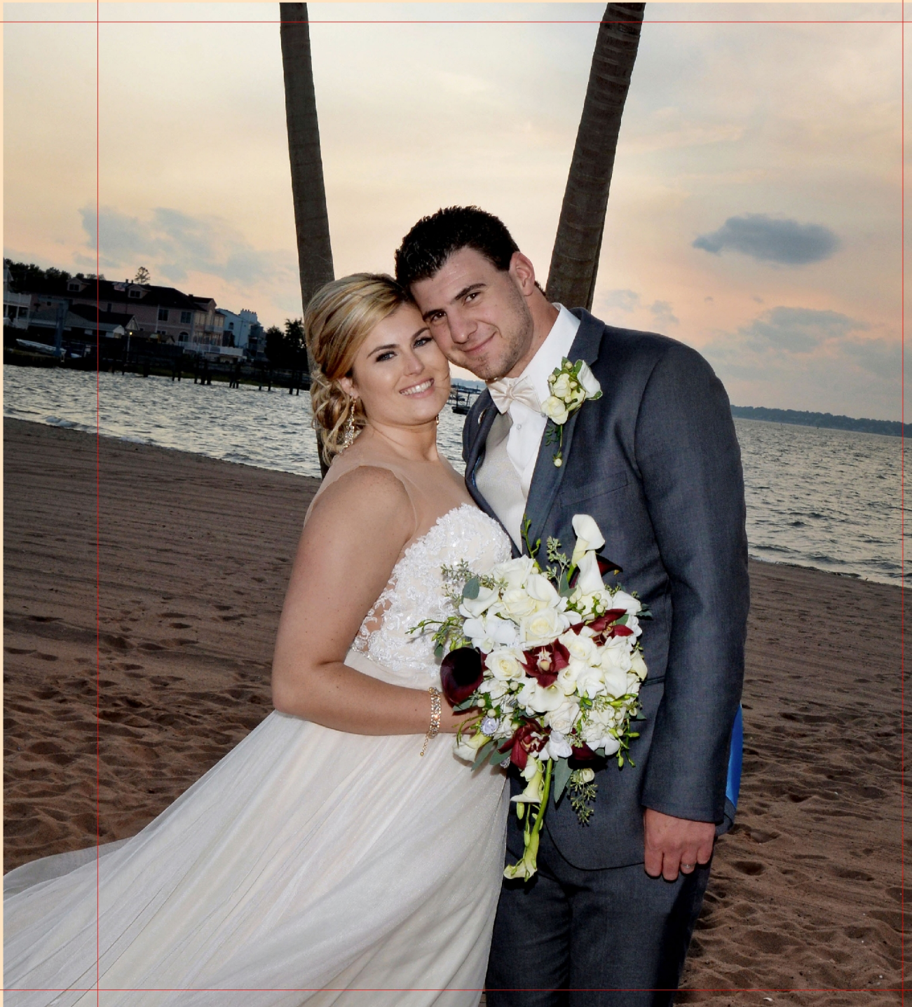
Wedding Album 10x10 (ATLANTICCITY-4-CONT)

It is necessary that the area outside the red lines, that is the abundance of the picture for the preparation of the cover, does not remain white. Must be covered entirely by the image selected, avoiding that it contains important details, because they will not appear on the front cover.