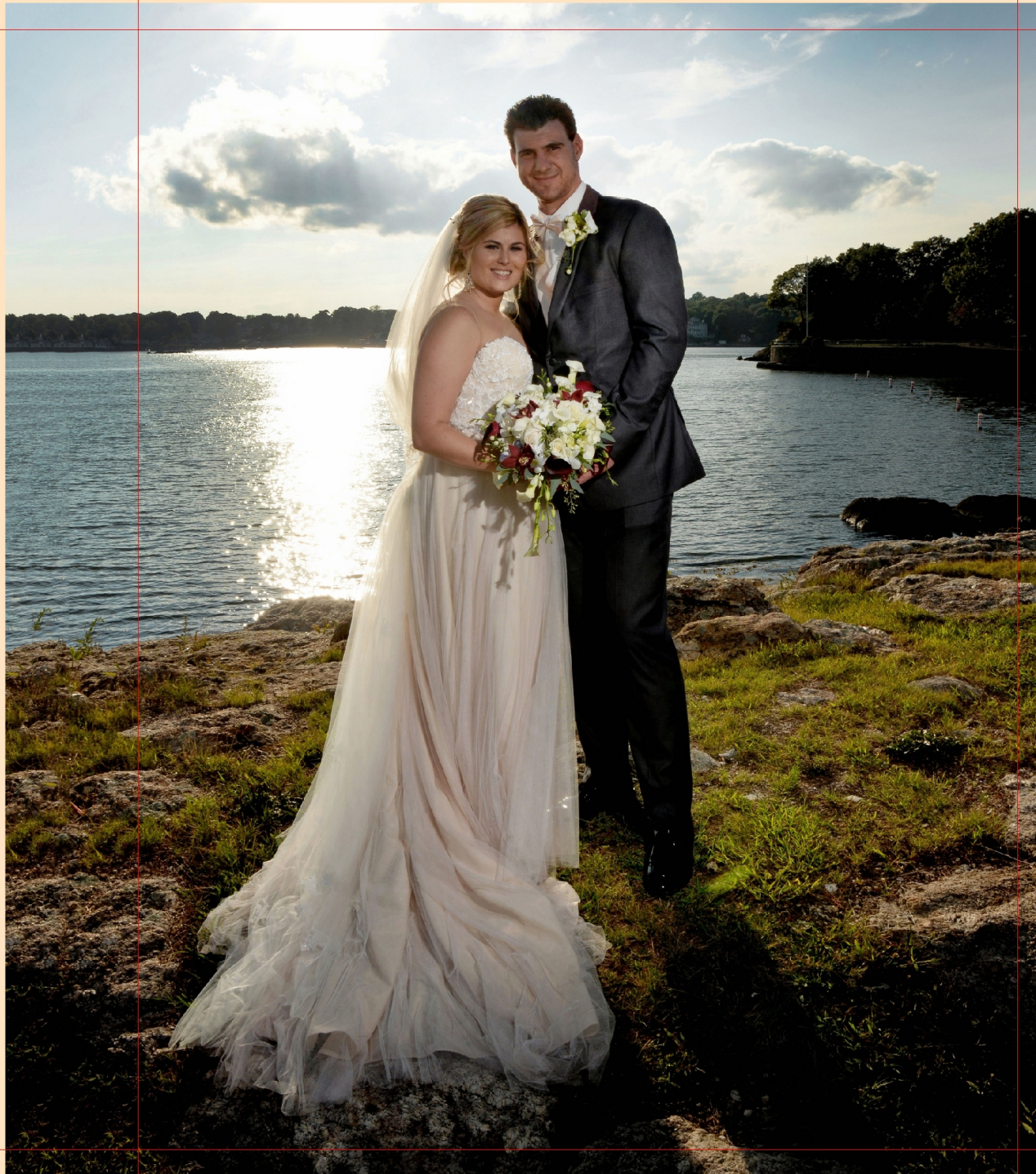
Family Flex 8x8

It is necessary that the area outside the red lines, that is the abundance of the picture for the preparation of the cover, does not remain white. Must be covered entirely by the image selected, avoiding that it contains important details, because they will not appear on the front cover.