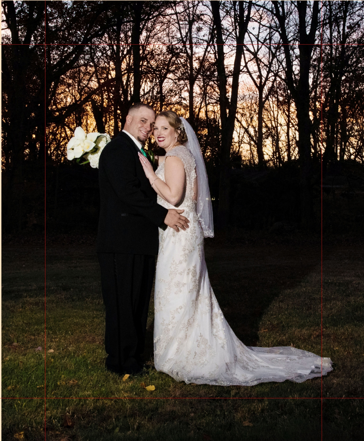
Family Flex 8x8

It is necessary that the area outside the red lines, that is the abundance of the picture for the preparation of the cover, does not remain white. Must be covered entirely by the image selected, avoiding that it contains important details, because they will not appear on the front cover.