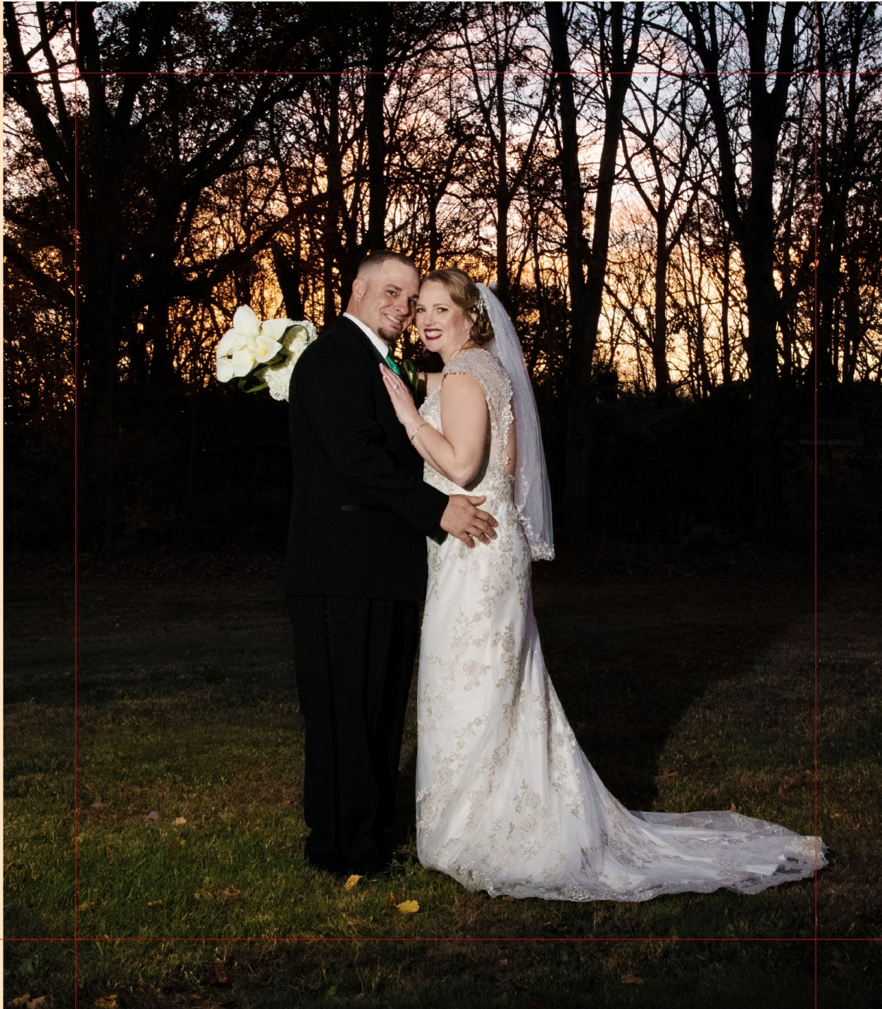
Wedding Album 12x12 (COMO-1-CONT)

It is necessary that the area outside the red lines, that is the abundance of the picture for the preparation of the cover, does not remain white. Must be covered entirely by the image selected, avoiding that it contains important details, because they will not appear on the front cover.