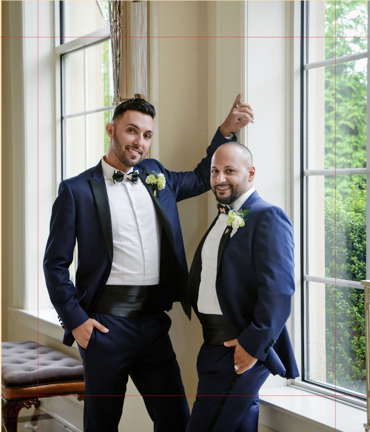
Wedding Album 10x10 (COMO-1-CONT)

It is necessary that the area outside the red lines, that is the abundance of the picture for the preparation of the cover, does not remain white. Must be covered entirely by the image selected, avoiding that it contains important details, because they will not appear on the front cover.