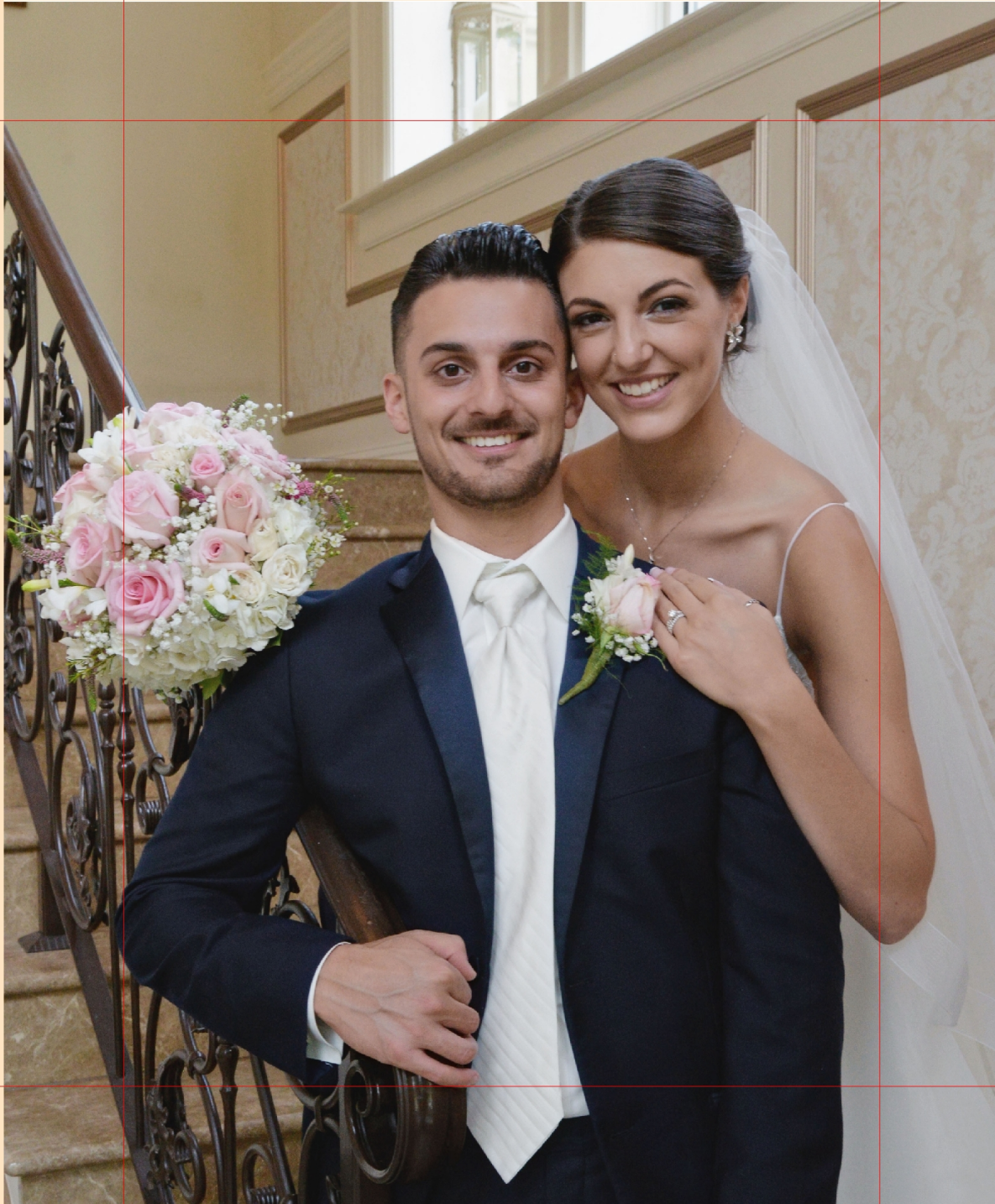
Family Flex 8x8

It is necessary that the area outside the red lines, that is the abundance of the picture for the preparation of the cover, does not remain white. Must be covered entirely by the image selected, avoiding that it contains important details, because they will not appear on the front cover.