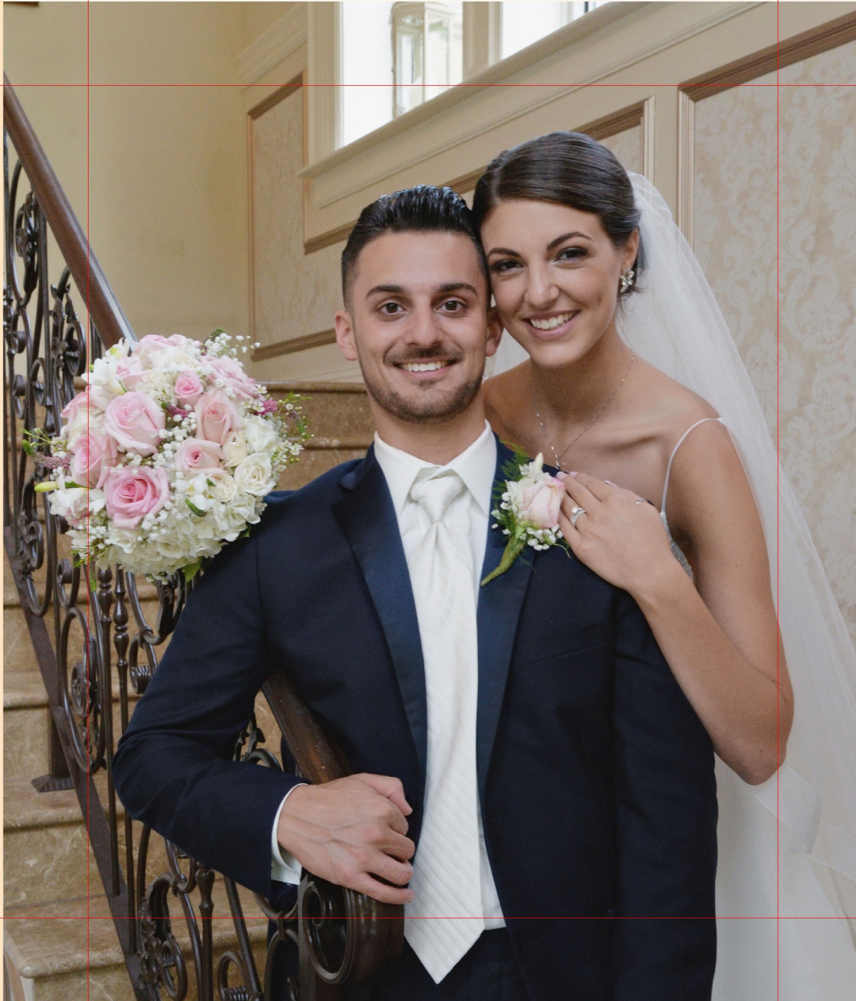
Wedding Album 10x10 (COMO-1-CONT)

It is necessary that the area outside the red lines, that is the abundance of the picture for the preparation of the cover, does not remain white. Must be covered entirely by the image selected, avoiding that it contains important details, because they will not appear on the front cover.